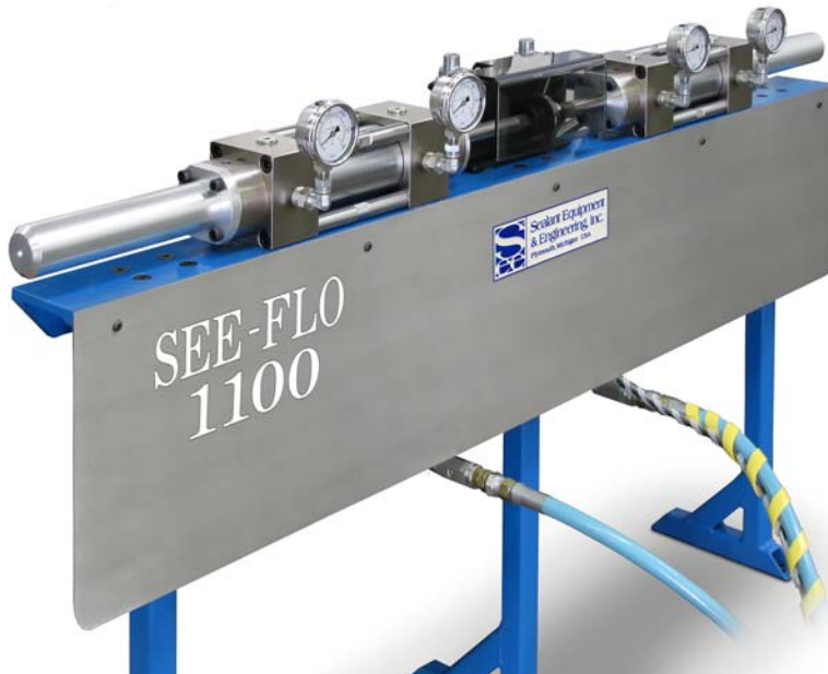
See-Flo 1100 Fixed Ratio Meter-Mix-Dispense System