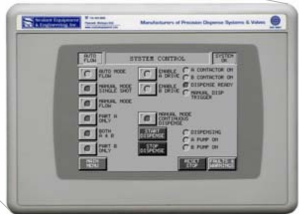
Electronic Operator Interface (HMI) with Monochrome Graphic Touch Screen