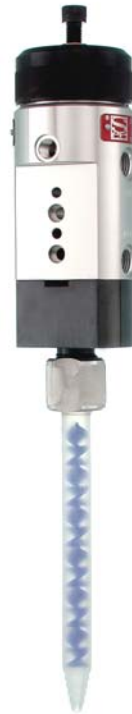
Automatic Mix Dispense Valve