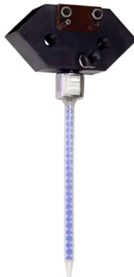
Check Valve Mix Manifold