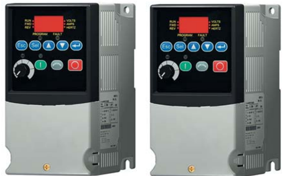
Part A and B Motor Speed Controls inside Panel