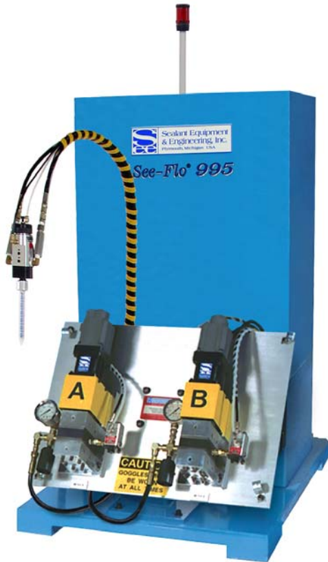
See-Flo 2K Gear Meter - Model #995