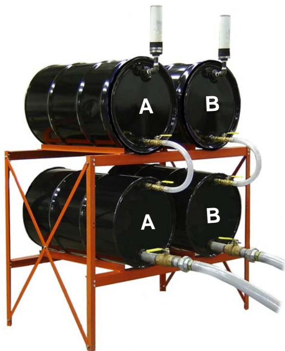
Drum Rack Supply with Air Driers, Hose Kits