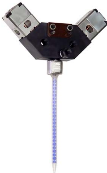
Dual Valve Mix Manifold