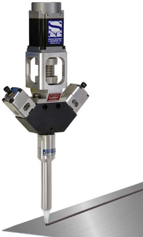
Power Static Mixer: Servo or Pneumatic Drive