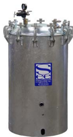
Tanks up to 60 Gal (227 Liters)