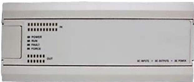
Programmable Logic Controller inside Panel