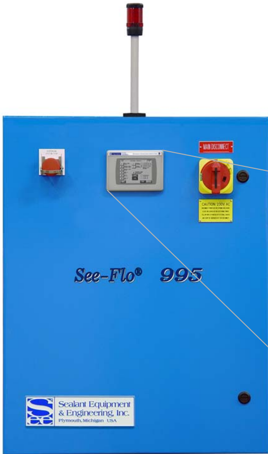
See-Flo 995 Control Panel for Dual Precision Gear Metering Mixing and Dispensing